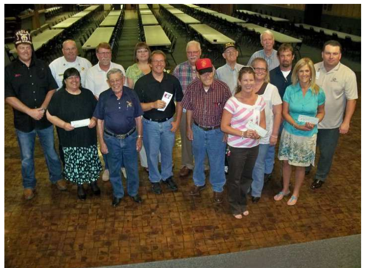
Eagles Club donates to several non-profit organizations!