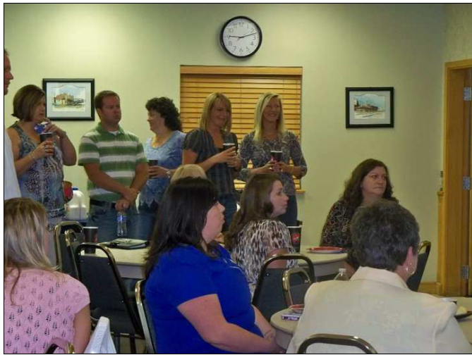
US Bank's Friday Coffee was great success with over 40 Chamber members in attendance!