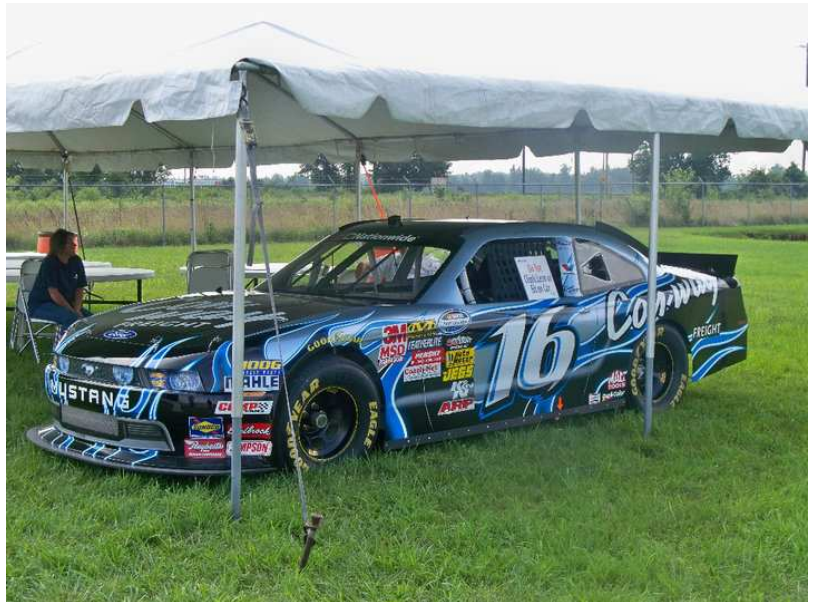
Conway Freight brings their Nascar race car to Poplar Bluff!

The Greater Poplar Bluff Area Chamber of Commerce is proud to recognize our TIME-HONORED MEMBERS.